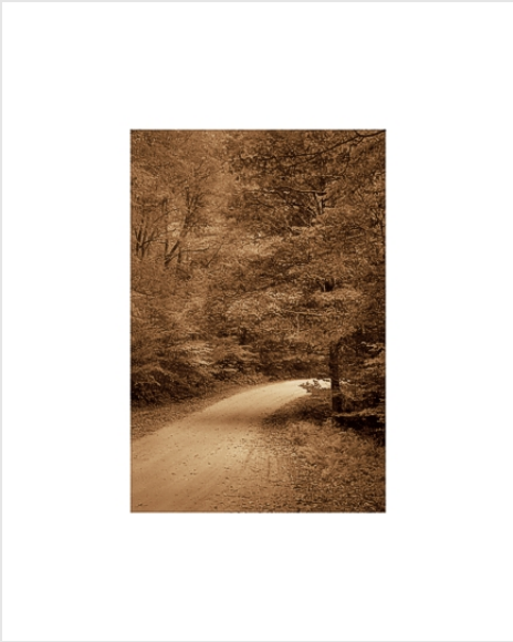
Moose River Road (#k00412) 16x20