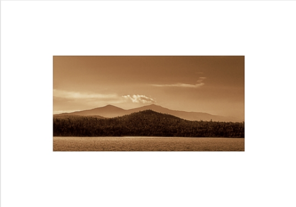
Creating Clouds (#k00331) 14x20