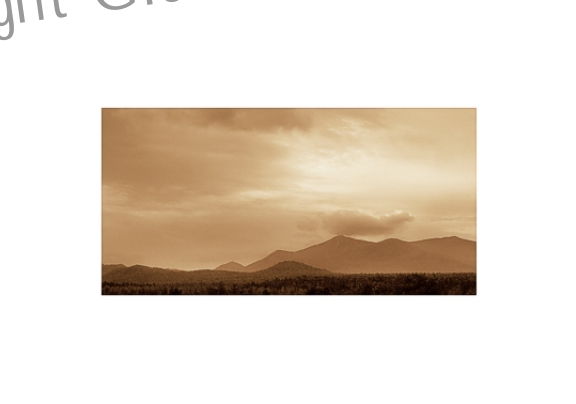
Afternoon Glow (#k00339) 14x20