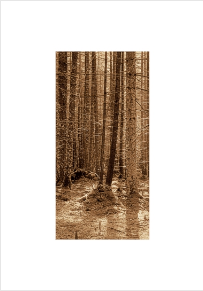
Pine Forest Light (#k00368) 14x20