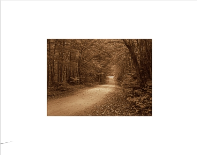
Forest Road (#k00407) 11x14